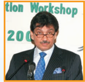
Honorable Federal Minister for Environment Makhdoom Syed Faisal Salleh Hayat

The Pakistan Wetlands Programme involved schools from the twin cities to compete in developing 3-D model on wetlands. This innovative approach to create awareness was part of the Programme's awareness raising and school outreach initiative. It was apparent from the overwhelming response received from the participating students that the Programme had managed to sensitise these junior ambassadors to care for and conserve these precious ecosystems (ecologically important constituent) of our environment.